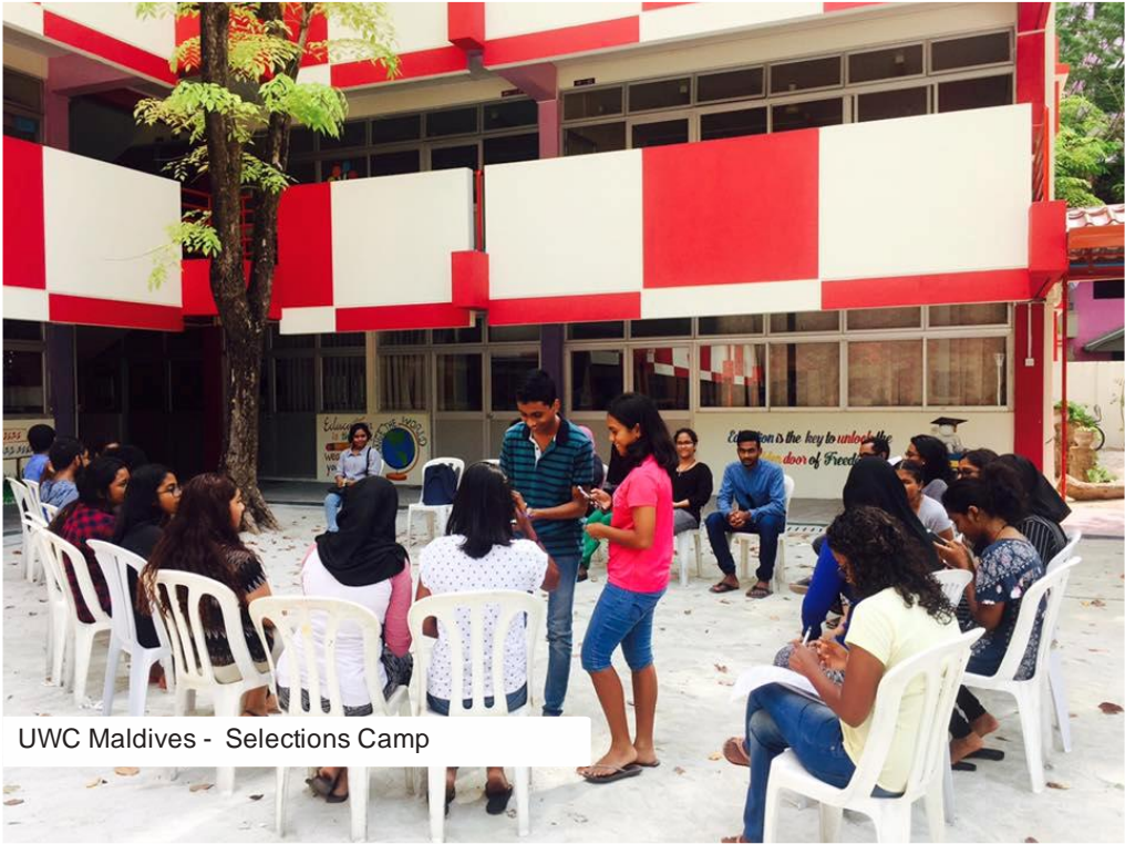
UWC Maldives - Selections Camp

The Chair of the UWC Maldives Executive Committee participated and represented UWC Maldives at the global UWC Congress held in Trieste Italy from 28 th to 29 th October, 2016. The main objective of the United World Colleges (UWC) was to bring all those involved in the UWC movement (UWC Board, UWC Council, UWC IO, UWCs, National Committees, alumni and volunteers) to connect and challenge each other on some of the most profound questions the movement face right now, including providing comments and input to the Strategy for United World Colleges. The Congress saw the conglomeration of 600 participants including: 15 members of the UWC International Board, 16 Heads of the Schools and Colleges, 17 staff from the UWC International Office, 39 members of the UWC Council, 52 parents of UWC students and alumni, 87 delegates from UWC schools and colleges and 234 UWC National Committee representatives from 129 countries. The congress featured parallel sessions focusing on the following four streams: Education, National Committees, Engagement and Outreach and Growth and Financial Sustainability.