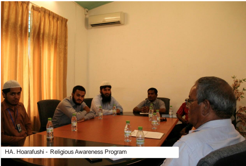
HA. Hoarafushi - Religious Awareness Program

High demand from public, made it a necessity for the council of Hoarafushi to conduct religious awareness sessions in the island during Ramadan 1437. The council needed to bring religious clerics to perform prayers and conduct sermons during the Ramadan. However, due to high costs the council faced a major issue in carrying out this program. With that in mind, the council approached AFTF seeking funds. AFTF, closely checked the proposal from Hoarafushi council and agreed to partially fund the program. With AFTF’s donation the program was successfully carried out during the Ramadan of 1437.