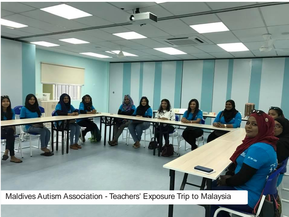
Maldives Autism Association - Teachers' Exposure Trip to Malaysia