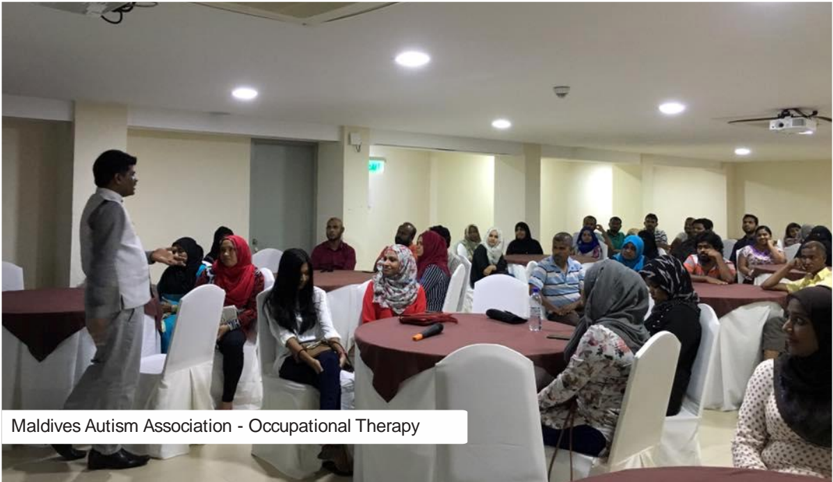
Maldives Autism Association - Occupational Therapy