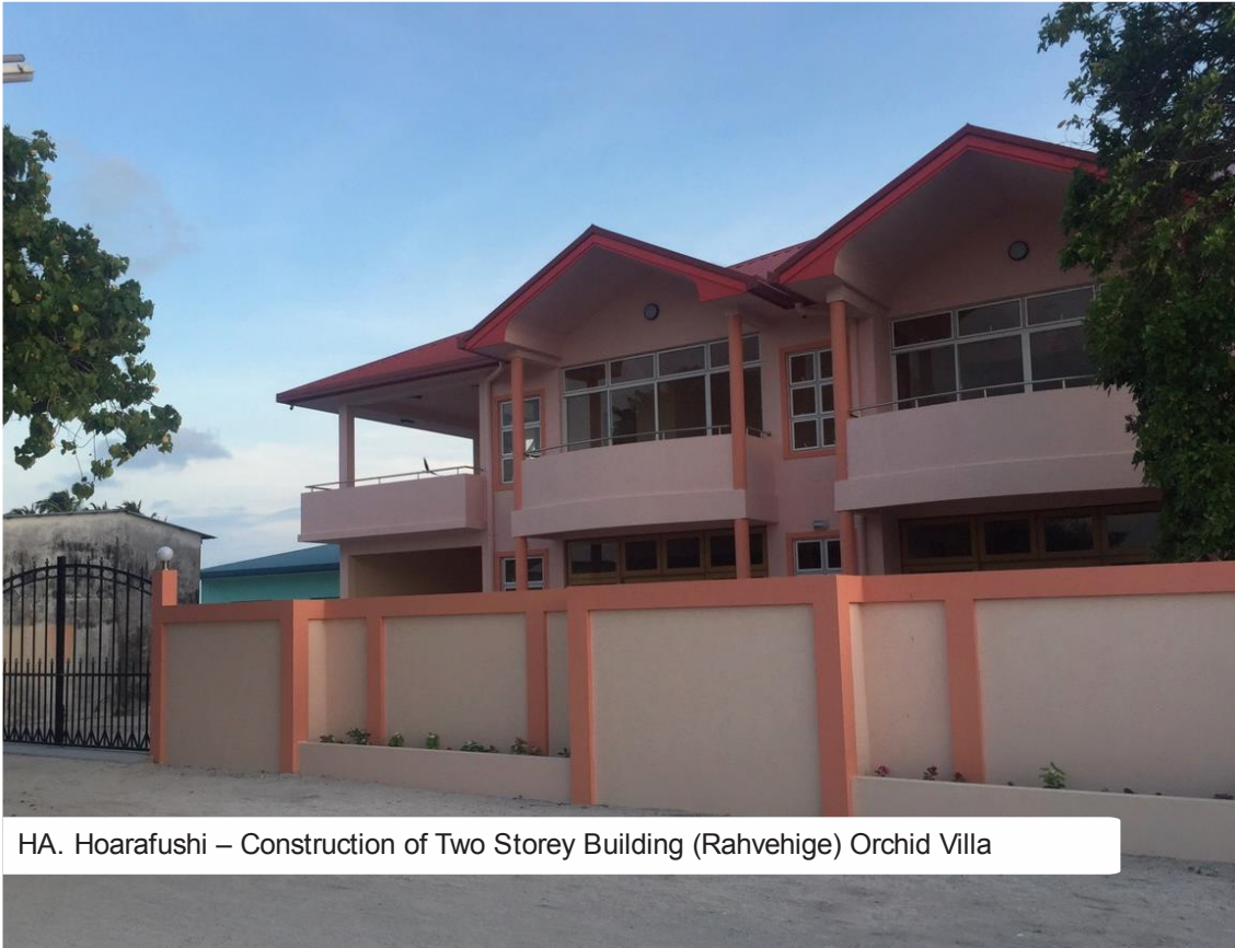
HA. Hoarafushi – Construction of Two Storey Building (Rahvehige) Orchid Villa

The new building at Orchid Villa will pave the way for further development of the island and provide a solution for the difficulties faced in accommodating guests.