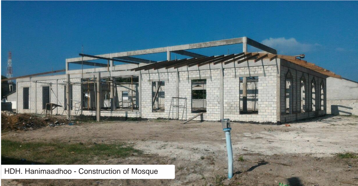
HDH. Hanimaadhoo - Construction of Mosque