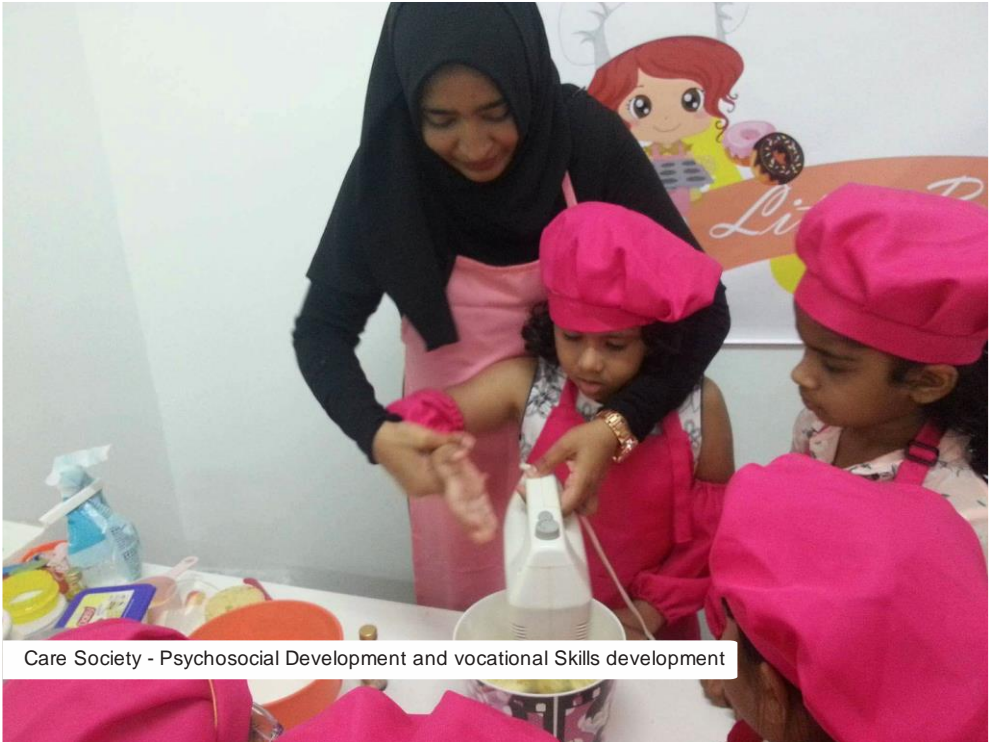
Care Society - Psychosocial Development and vocational Skills development

progress reports were drawn to these students. Fourteen Parent consultation, assessments and support were provided for target members and psychosocial support was provided for 5 target members. Under the program 2 students were able to get internship program for a 3 month tailoring course. Both the students completed the program and one students continued to work. One student works as a paid graphic design intern and one student works as an unpaid intern at Care Society.