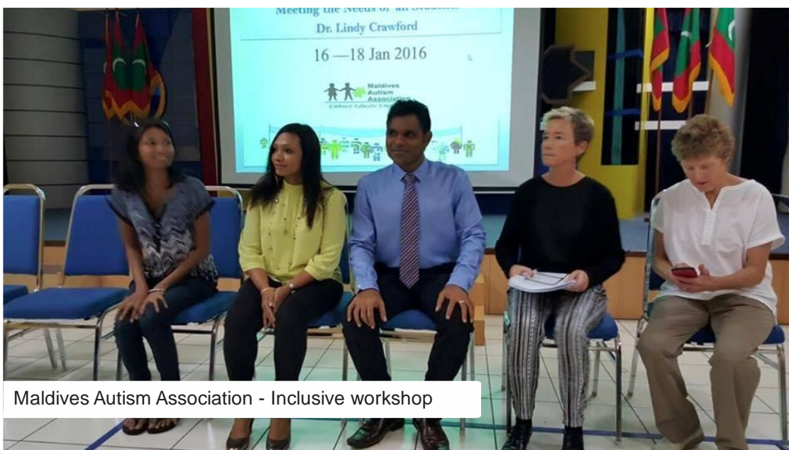
Maldives Autism Association - Inclusive workshop

All three days proved very informative and useful for all our participants. It was amazing to see the teachers bond throughout the workshop and even more amazing to see the passion that teachers have towards education of children with special needs.