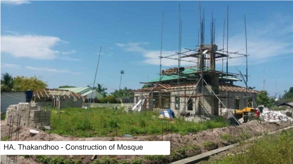
HA. Thakandhoo - Construction of Mosque