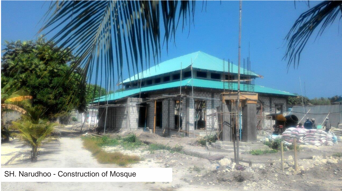
SH. Narudhoo - Construction of Mosque

Sh. Narudhoo has a population of roughly 1800 people. There are 4 mosques in the island, among which is the old Masjidhul Hudha, which will no longer be used after completion of the new mosque. In November 2016, the Council Office requested the Ministry of Islamic Affairs to give the same name to the new mosque. The approval was not received by end of year.