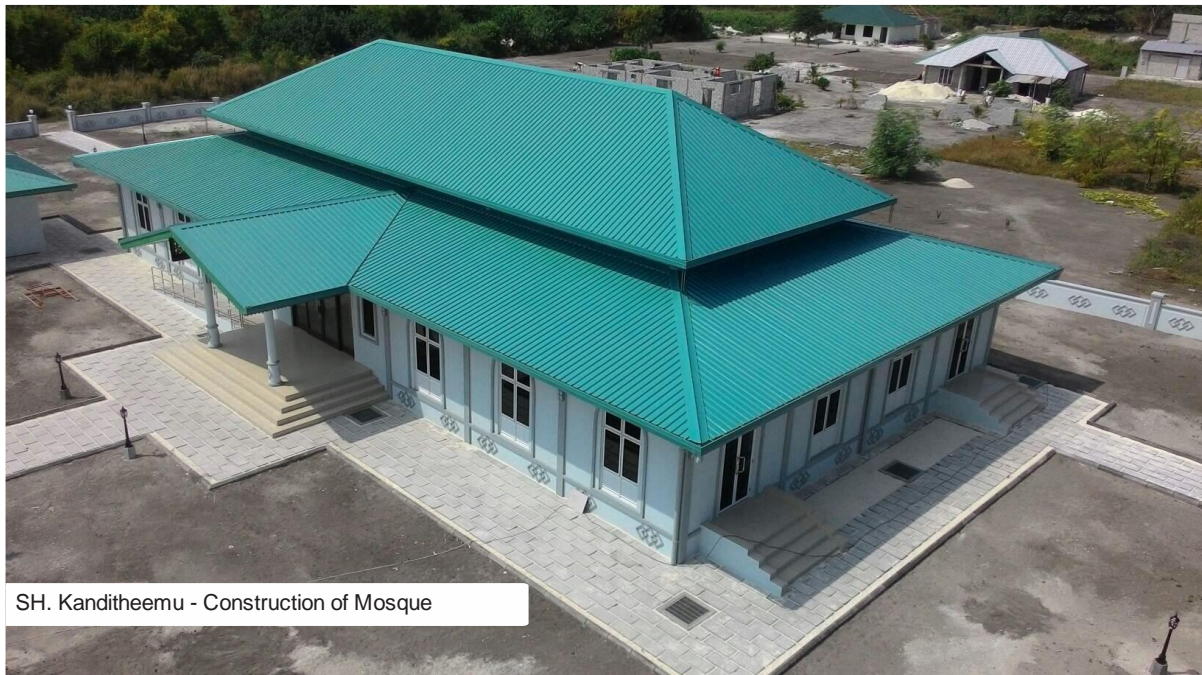
SH. Kanditheemu - Construction of Mosque

it the main mosque of the island. However, after its inauguration, Masjidhul Thauba, will become the main mosque in the island.