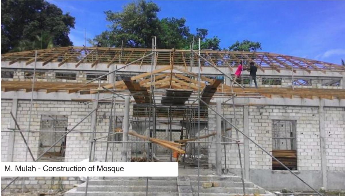
M. Mulah - Construction of Mosque