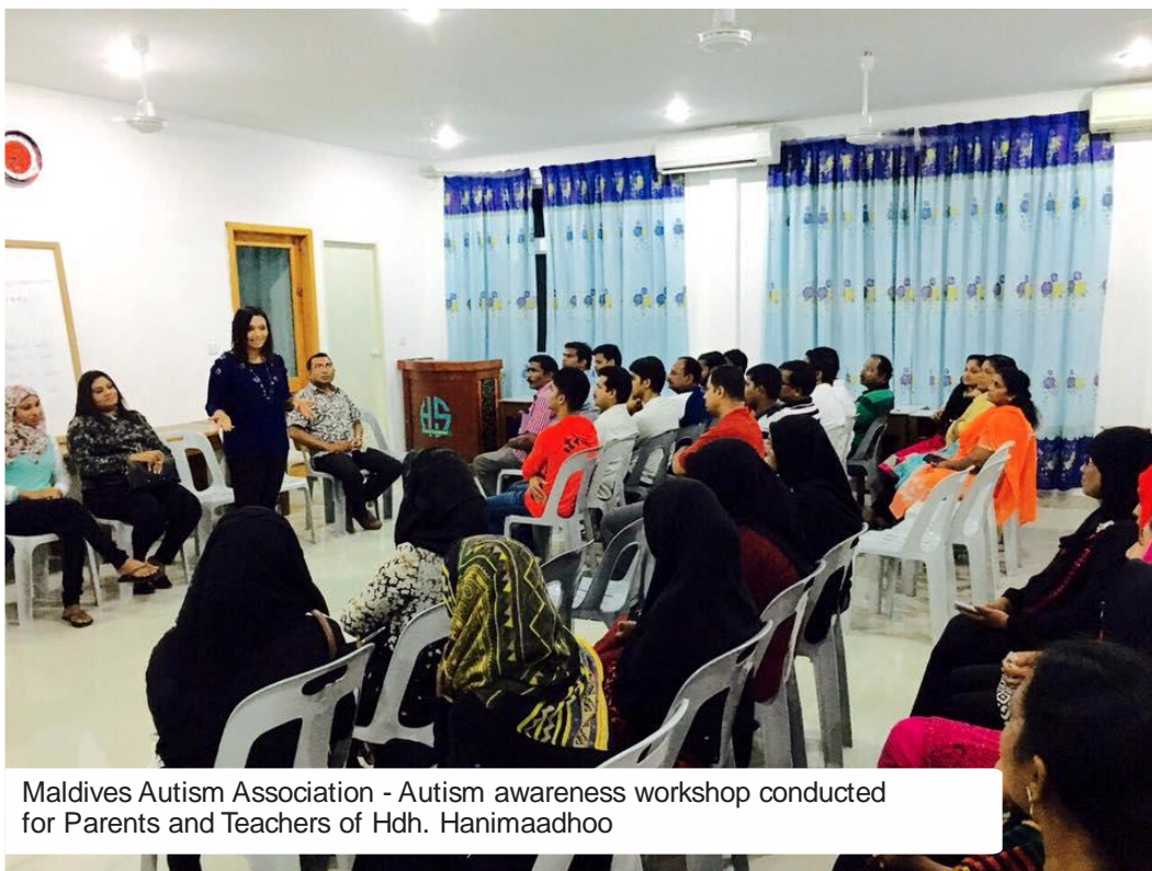
Maldives Autism Association - Autism awareness workshop conducted for Parents and Teachers of Hdh. Hanimaadhoo

Moreover, art for autism workshop was eye opening for the parents that their child can be a productive child in the society. The workshop gave an entirely different perspective on autism, that an autism person is not disabled, rather has a differently wired brain. The workshop also helped the parents, teachers to shape their passion and career. Participants were able to experience the love, talents, the beautiful minds and the uncorrupted souls of young children who are in the autism spectrum.