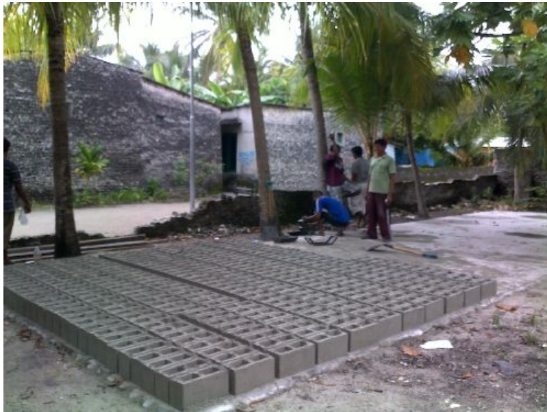
R.Angolhitheem: Bricks for construction of NGO building

Project Status: A total number of 130 cement bags were delivered on 08 th July 2011. Due to some constraints such as weather, work was not completed on the estimated date. It was finally completed on 25 June 2012 making a total of 7800 bricks.