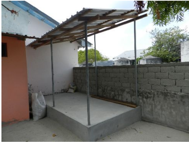
R.Meedho: Installation of water tanks

Project Status: Items were delivered by 24 th December 2011 and has been completed by 24 th May 2012, both roofing of toilet and installation of water tank. Upgrading of facilities in the school helped in creating a better environment for the students.