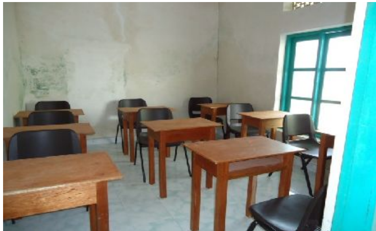
Sh. Maroshi: Quran class

Location: Maroshi Project Title: Quran class Funding Amount: USD 959.02 Project Summary: 'JamiyyaththuTharaabuth' NGO submitted the proposal to create opportunities to improve the skills of reciting the Holy Quran and learn by-heart. Also, to create interest for it among all ages of locals in the island Project Status: Items were delivered during the last quarter of 2011. However classes haven't begun due to financial issues faced regarding teacher's fee and other items. NGO have been able to secure a space for the classes to be conducted and they are currently working to solve the other issues faced so the classes can officially be started at earliest.