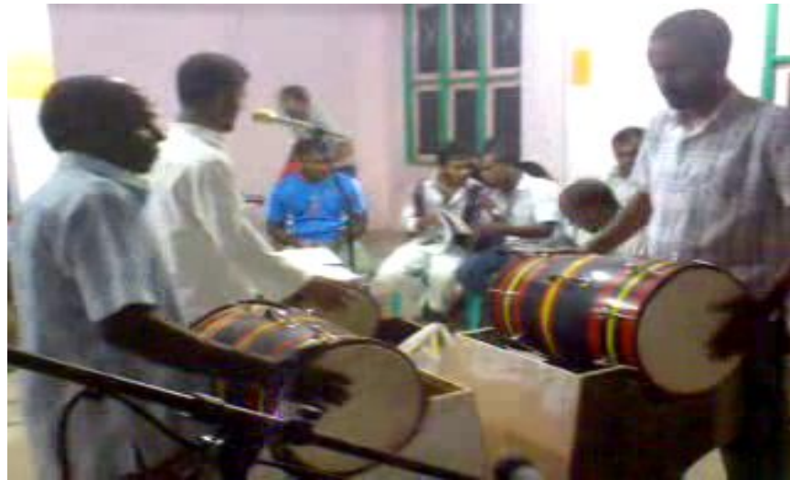
Sh.Komandoo: Items for 'BoduBeru' Group

Project Status: Items were delivered and NGO appointed a committee to monitor reviving of cultural activities in the island. In 2011, the committee arranged teaching sessions for youths interested in bodu-beru. A group was formed and they have been hired to play on eid holiday shows and on circumcision ceremonies. This helps to generate an income for the NGO.