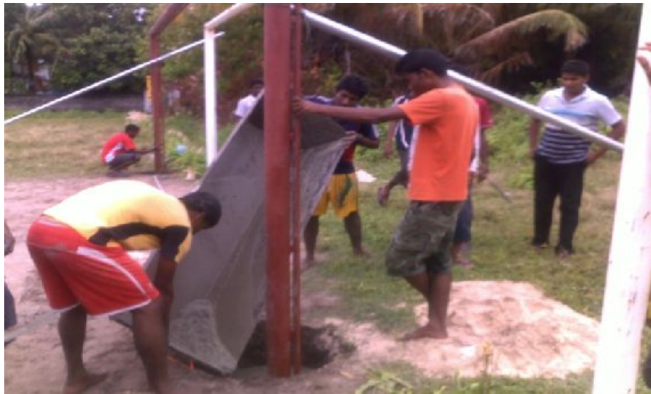
Sh. Lhaimagu: Development of sports area

Project Status: Items were delivered on 16 th June 2011 and work was completed within a month. Sports area has been developed with the support of NGO members, youth and volunteers among the locals and as well the Island Council. NGO appreciated the support given by AFTF.