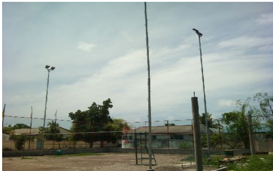
Sh.Funadhoo: Lighting of volleyball court

Project Status: Items were delivered on 24 th May 2011 and NGO members have worked voluntarily to finish this project. For a second phase of the project, members are trying to build a rostrum in the court. Friendly matches with other island teams were played and when second phase is over NGO is planning a grand opening of the court.