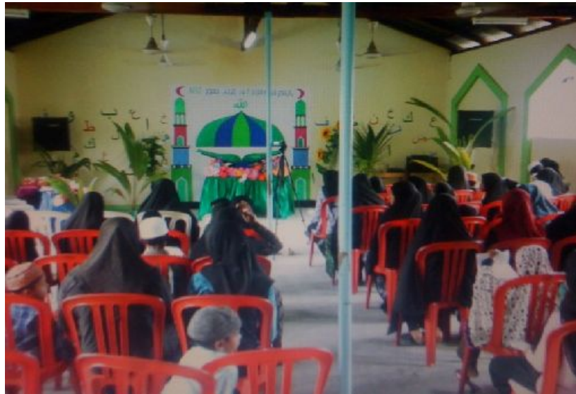
Sh.Bilehfahi: Quran Competition

Project Status: Competition was held from 22- 27 Ramadan 1432 with a total of 155 children competing in different age categories. 69 children participated in reciting by the book and 86 participated in reciting by-heart category. Items were delivered on 22 nd November 2011. During preparations for the prize ceremony a fire incident occurred and burned the place with most of the donations, office electronics, furniture and documents. Hence, committee is in discussion with parents and relevant people on fixing a date for the prize awarding ceremony.