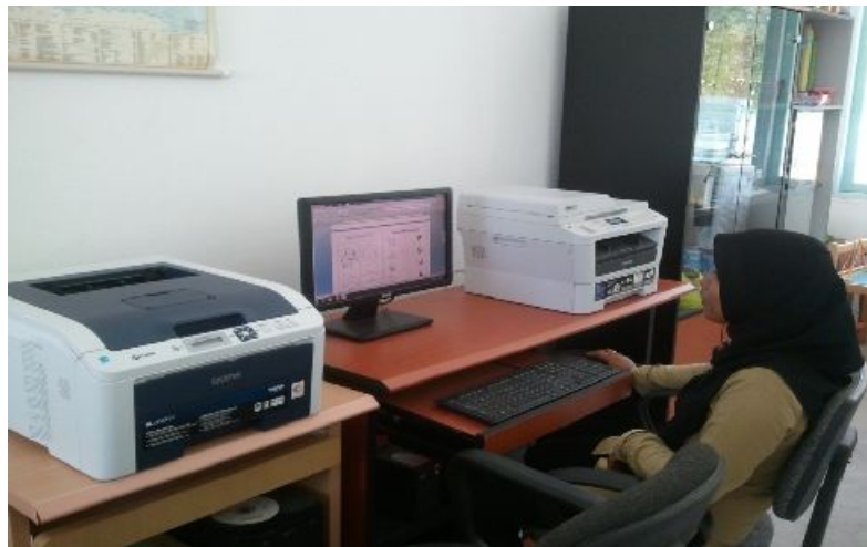
Sh.Goidhoo: Items for pre-school

Project Status: Items were delivered on 15 th April 2012. In addition to the requested items, chairs were donated to the NGO. The chairs will be used in social events of the island. NGO also plans to give these chairs on rent, for events on the island coordinated by business parties or private companies or NGOs from Male'. The printing and copier service is also planned to be given on a small charge, hence securing an income for the maintenance of the equipment.