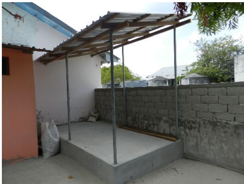
R.Meedho: Installation of water tanks

Location: Meedhoo Project Title: Roofing of pre-school toilet and installation of water tanks Funding Amount: USD 859.48 Project Summary: Meedhoo pre-school submitted the proposal of installing a water tank in the school to minimize health problems caused by drinking unsafe water. In addition, as the toilets are not roofed it is difficult for the students to use it in bad weather. Project Status: Items were delivered by 24 th December 2011 and has been completed by 24 th May 2012, both roofing of toilet and installation of water tank. Upgrading of facilities in the school helped in creating a better environment for the students.