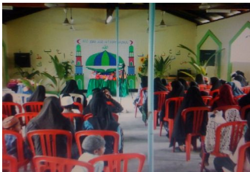
Sh.Bilehfahi: Quran Competition

Project Status: Competition was held from 22- 27 Ramadan 1432 with a total of 155 children competing in different age categories. 69 children participated in reciting by the book and 86 participated in reciting by-heart category. Items were delivered on 22 nd November 2011. During preparations for the prize ceremony a fire incident occurred and burned the place with most of the donations, office electronics, furniture and documents. Hence, committee is in discussion with parents and relevant people on fixing a date for the prize awarding ceremony.