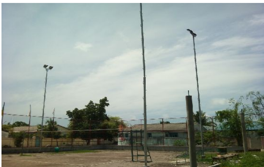
Sh.Funadhoo: Lighting of volleyball court

Project Status: Items were delivered on 24 th May 2011 and NGO members have worked voluntarily to finish this project. For a second phase of the project, members are trying to build a rostrum in the court. Friendly matches with other island teams were played and when second phase is over NGO is planning a grand opening of the court.