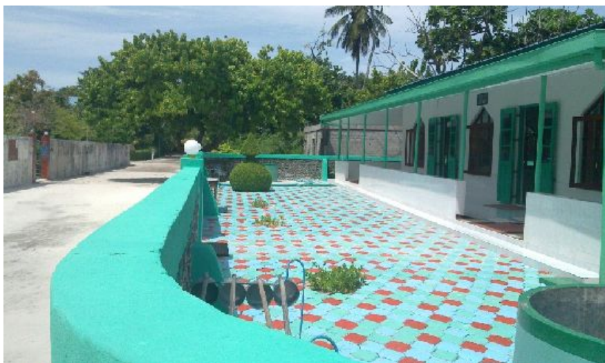
Sh.Narudhoo: Paving of Mosque courtyard

Location: Narudhoo Project Title: Paving of Mosque courtyard Funding Amount: USD 674.75 Project Summary: 'Club renaissance' submitted the proposal to pave the courtyard as this will make it easy to walk into the mosque and also to keep the mosque clean and pleasant. The paving would also prevent flooding during the rainy monsoon. Project Status: NGO started work on 20 th June 2011 and paving of the mosque courtyard was completed by 10 th June 2012. While work was going-on mosque was closed with the permission of Island Council. The support of NGO members, volunteers and council was highly appreciated by the NGO during the paving of mosque courtyard.