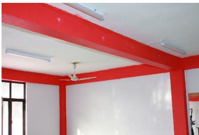
R.Ungoofaaru: Finishing of pre-school classroom

Location: Ungoofaaru Project Title: Finishing of Pre-school classrooms Funding Amount: USD 3,070.49 Project Summary: 'Jamiyyathusaif' NGO submitted the proposal to complete the pre -school classrooms so that more students can be educated. They also plan to teach students and adults to recite Holy Quran in these new classrooms. Project Status: Items were delivered in August 2011 and work was completed by November 2011. Two classrooms were finished. More students are enrolled in the school and educated in a comfortable environment.