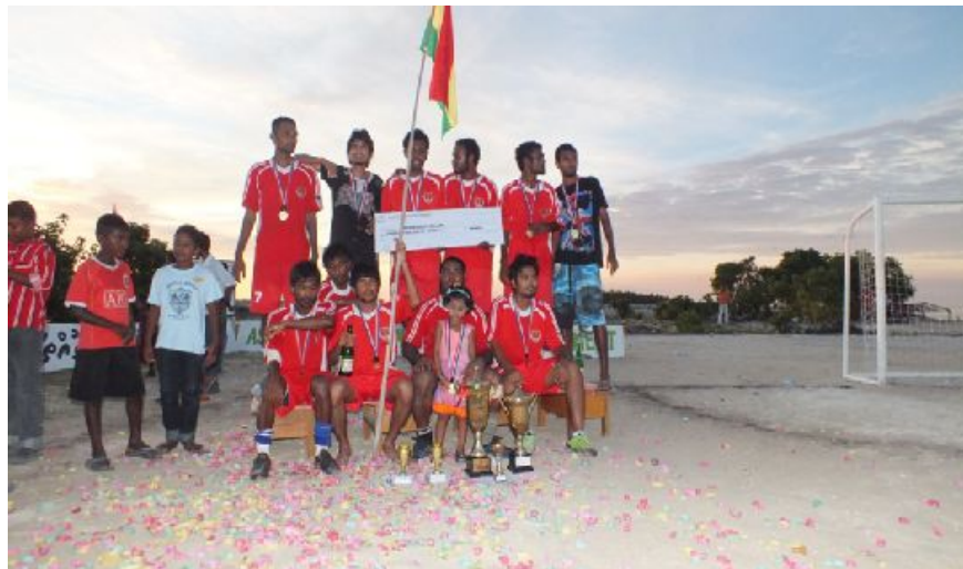
Sh.Komandoo: AKYD futsal cup 2011

Project Status: Items were delivered and tournament began during Eid holidays. A total of 9 teams participated. Tournament went smoothly achieving the objectives and was a success.