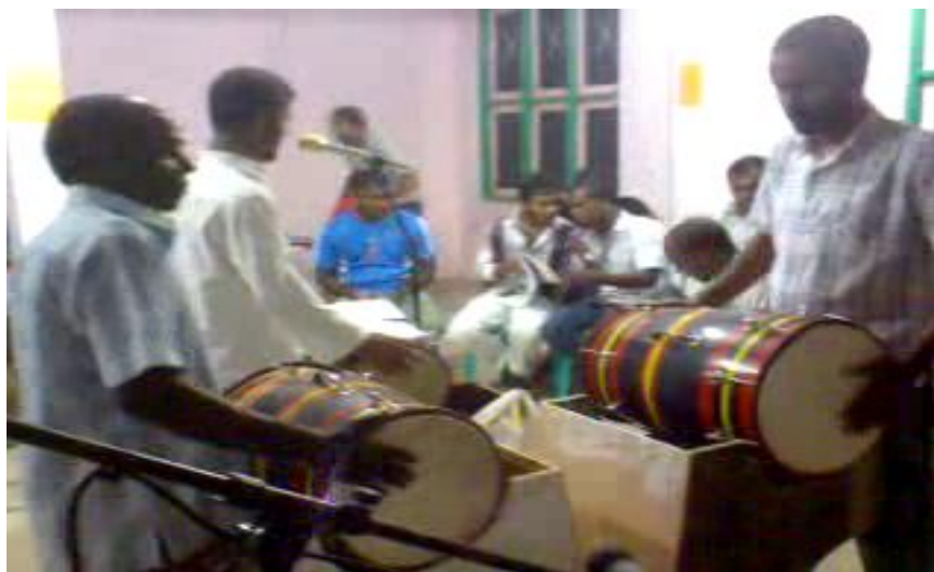
Sh.Komandoo: Items for 'BoduBeru' Group

Project Status: Items were delivered and NGO appointed a committee to monitor reviving of cultural activities in the island. In 2011, the committee arranged teaching sessions for youths interested in bodu-beru. A group was formed and they have been hired to play on eid holiday shows and on circumcision ceremonies. This helps to generate an income for the NGO.