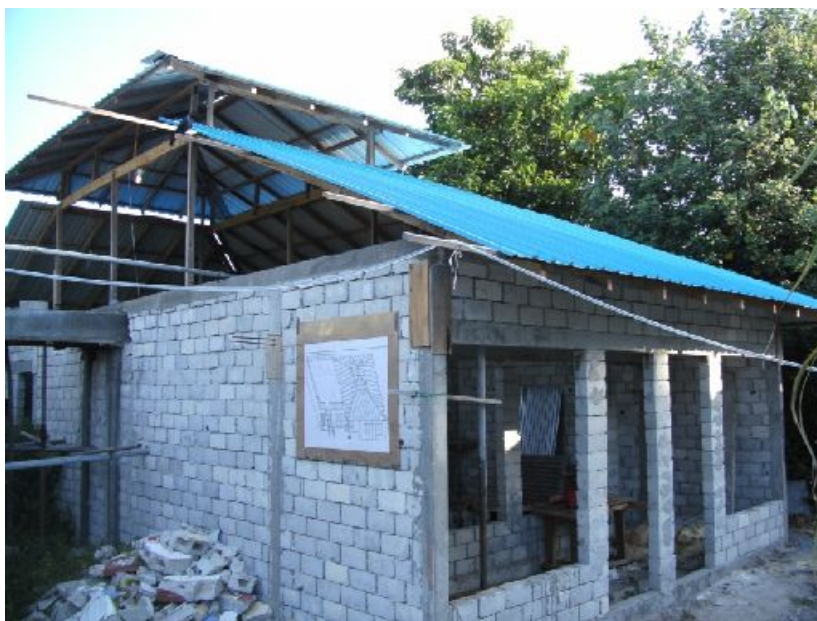
N.Henbadhoo: Construction and roofing of roofing multi-purpose building