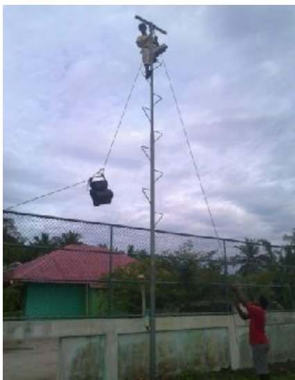
Sh.Kanditheem: Lighting of sports area

Location: Kanditheem Project Title: Lighting of sports area Funding Amount: USD 1,337.70 Project Summary: Youth of the island submitted the proposal as there is no area for the players to conduct practice sessions during the night. Solving this will help the youth in improving their skills in sports and make better use of the free time. This also brings together youth of the community. Project Status: Items were delivered and work started on 1 st July. A total of 40 youths volunteered to finish the project. They worked in the evening daily after office hours. Testing was done on 1 st August and sports area was opened on 2 nd August 2011.