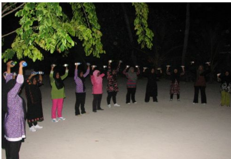
N.Holhudhoo: Setting up of aerobics class