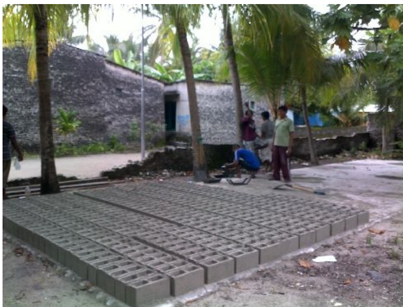
R.Angolhitheem: Bricks for construction of NGO building

Project Status: A total number of 130 cement bags were delivered on 08 th July 2011. Due to some constraints such as weather, work was not completed on the estimated date. It was finally completed on 25 June 2012 making a total of 7800 bricks.