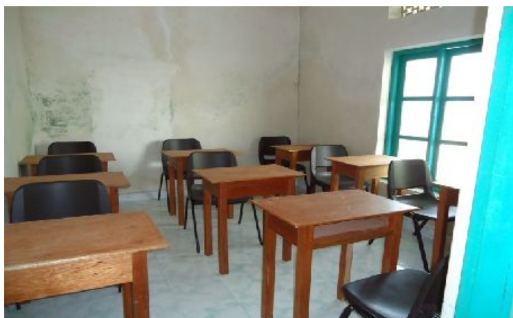
Sh.Maroshi: Quran class

Location: Maroshi Project Title: Quran class Funding Amount: USD 959.02 Project Summary: 'JamiyyaththuTharaabuth' NGO submitted the proposal to create opportunities to improve the skills of reciting the Holy Quran and learn by-heart. Also, to create interest for it among all ages of locals in the island Project Status: Items were delivered during the last quarter of 2011. However classes haven't begun due to financial issues faced regarding teacher's fee and other items. NGO have been able to secure a space for the classes to be conducted and they are currently working to solve the other issues faced so the classes can officially be started at earliest.