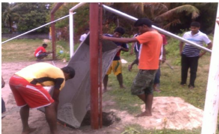
Sh. Lhaimagu: Development of sports area

Project Status: Items were delivered on 16 th June 2011 and work was completed within a month. Sports area has been developed with the support of NGO members, youth and volunteers among the locals and as well the Island Council. NGO appreciated the support given by AFTF.