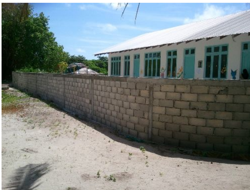
Sh.Goidhoo: Construction of boundary wall for pre-school

Location: Goidhoo Project Title: Construction of boundary wall for pre-school Funding Amount: USD 2,415.80 Project Summary: 'Association for Goidhoo Youth Development' took initiation in submitting the proposal to complete the boundary wall of pre-school for security reasons and to provide a safe learning environment for the students. Project Status: Items were delivered on 20 th June 2011 and work started in July 2011. When monitored in October 2012 NGO reports that paint work will be completed within a week. NGO also notes that they are happy having the boundary wall thus providing a safe and secure learning environment for the students.