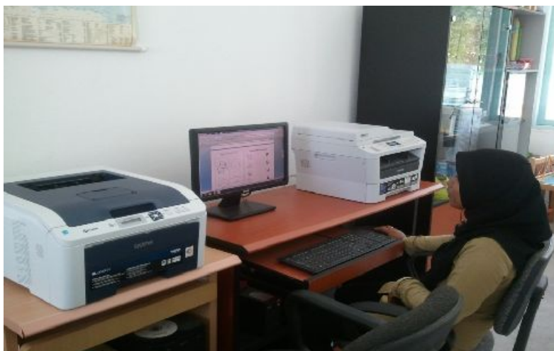
Sh.Goidhoo: Items for pre-school

Project Status: Items were delivered on 15 th April 2012. In addition to the requested items, chairs were donated to the NGO. The chairs will be used in social events of the island. NGO also plans to give these chairs on rent, for events on the island coordinated by business parties or private companies or NGOs from Male'. The printing and copier service is also planned to be given on a small charge, hence securing an income for the maintenance of the equipment.